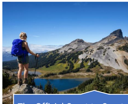
The Official Coast to Coast Walking Challenge