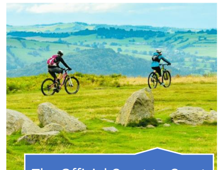
The Official Coast to Coast Cycling Challenge